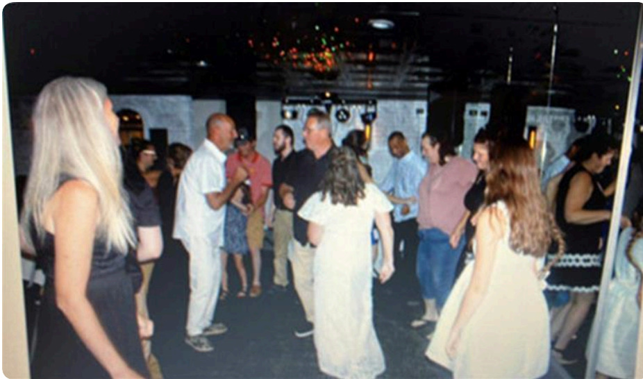
"Precious jewel, you glowed, you shone, reflecting all the good things in the world." - Maya Angelou