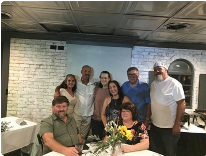
A beautiful night with a beautiful soul. You will be missed my friend.