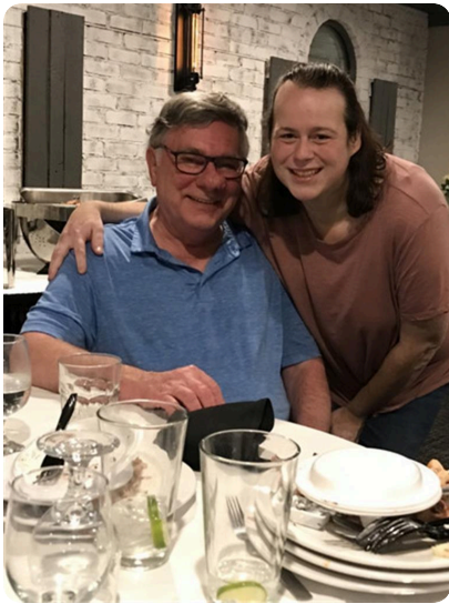
A beautiful night with a beautiful soul. You will be missed my friend.