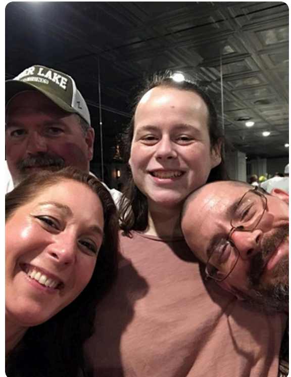
A beautiful night with a beautiful soul. You will be missed my friend.