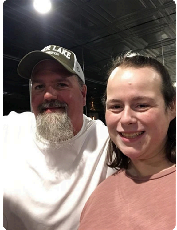
A beautiful night with a beautiful soul. You will be missed my friend.