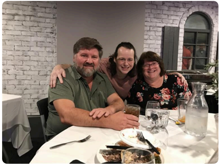
A beautiful night with a beautiful soul. You will be missed my friend.