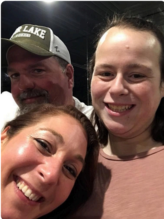
A beautiful night with a beautiful soul. You will be missed my friend.